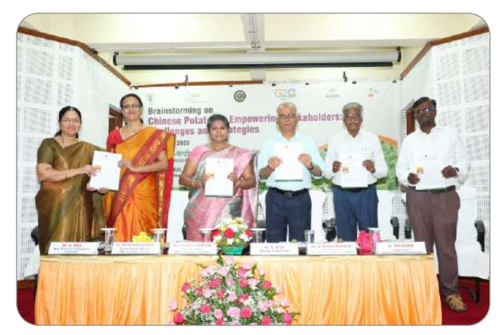
Glimpses of Brainstorming on Chinese potato for empowering stakeholders