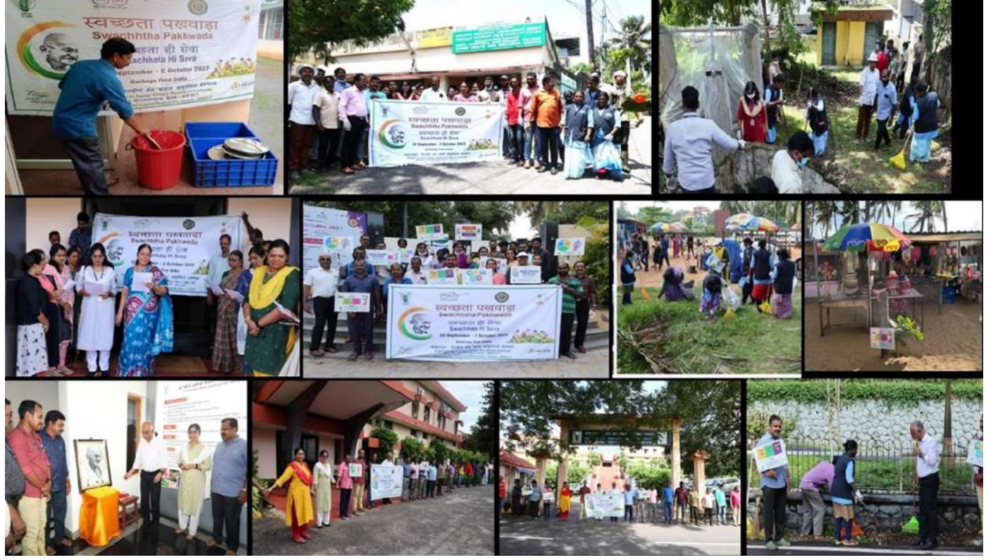
Glimpses of Swachhata campaign