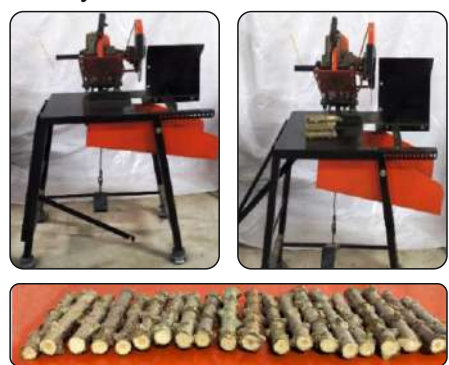
Tapioca stem cutter

A portable self-propelled tapioca stem cutter was developed which consists of petrol engine (1.6 HP), rotary cutting blade (12-inch diameter), frame, pulleys, platform, inlet and outlet assembly and stopper and this can be operated by hand or pedal. The adjustable feature on the stopper is used to produce the required length of tapioca setts. Rotary cutting blades attached to the prime mower that rotate at 1000 RPM will produce uniform and round cutting of tapioca setts for high quality tapioca setts production. The developed machine was tested for performance and the cutting efficiency, percentage of damaged setts and output capacity were found to be 98%, 0.45% and 3600 setts per hour, respectively.